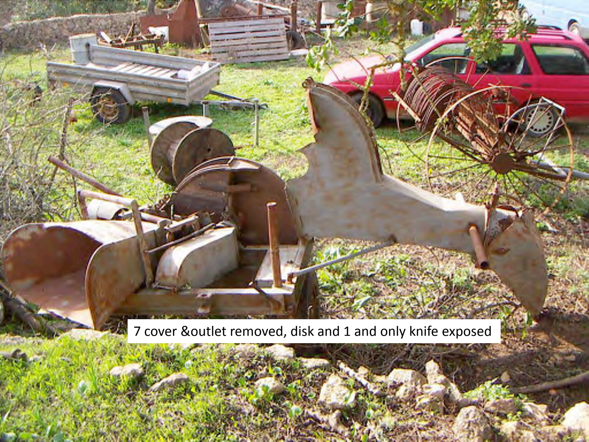
7 cover & outlet removed, disk and 1 and only knife exposed