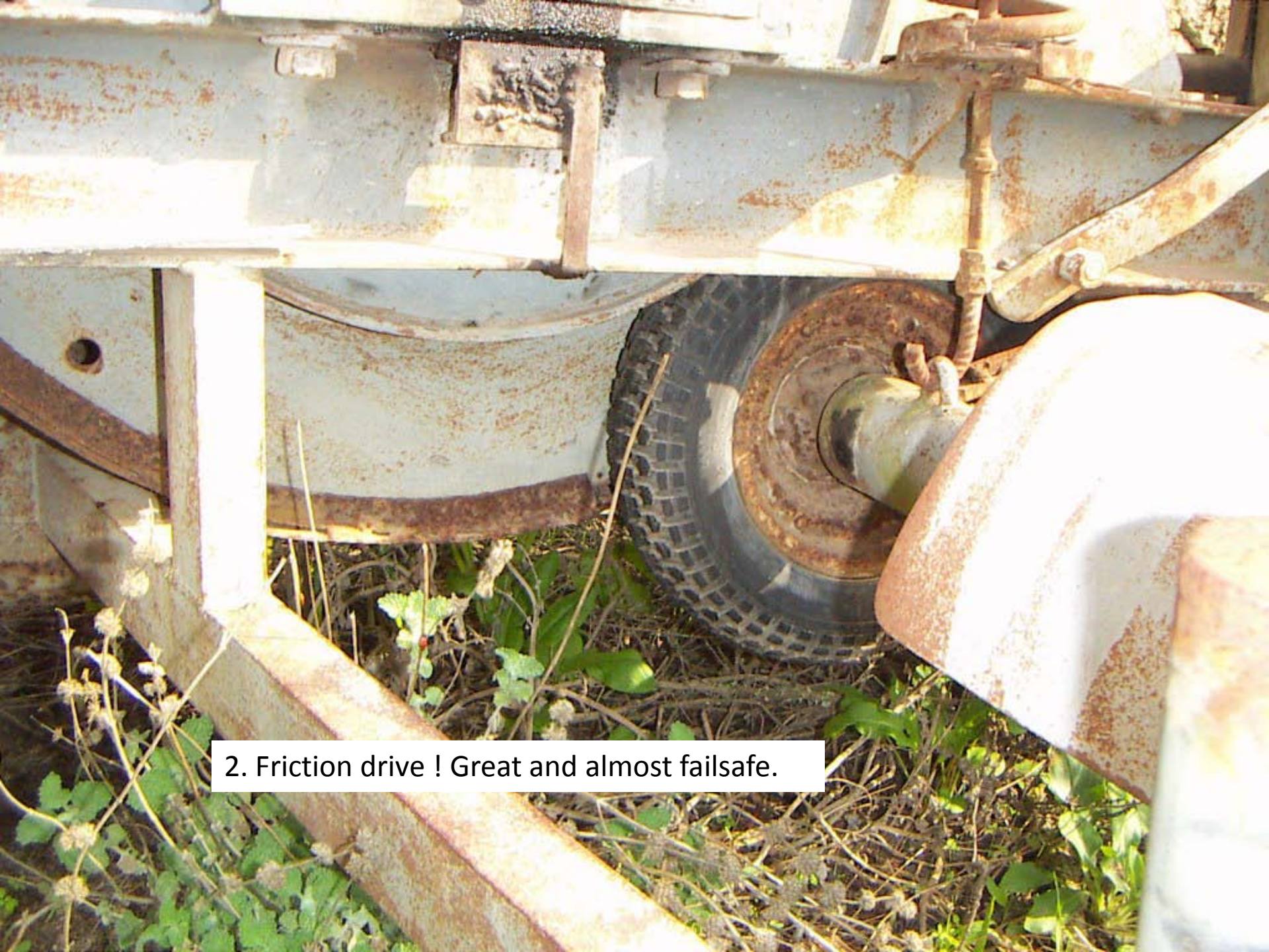
2. Friction drive ! Great and almost failsafe.