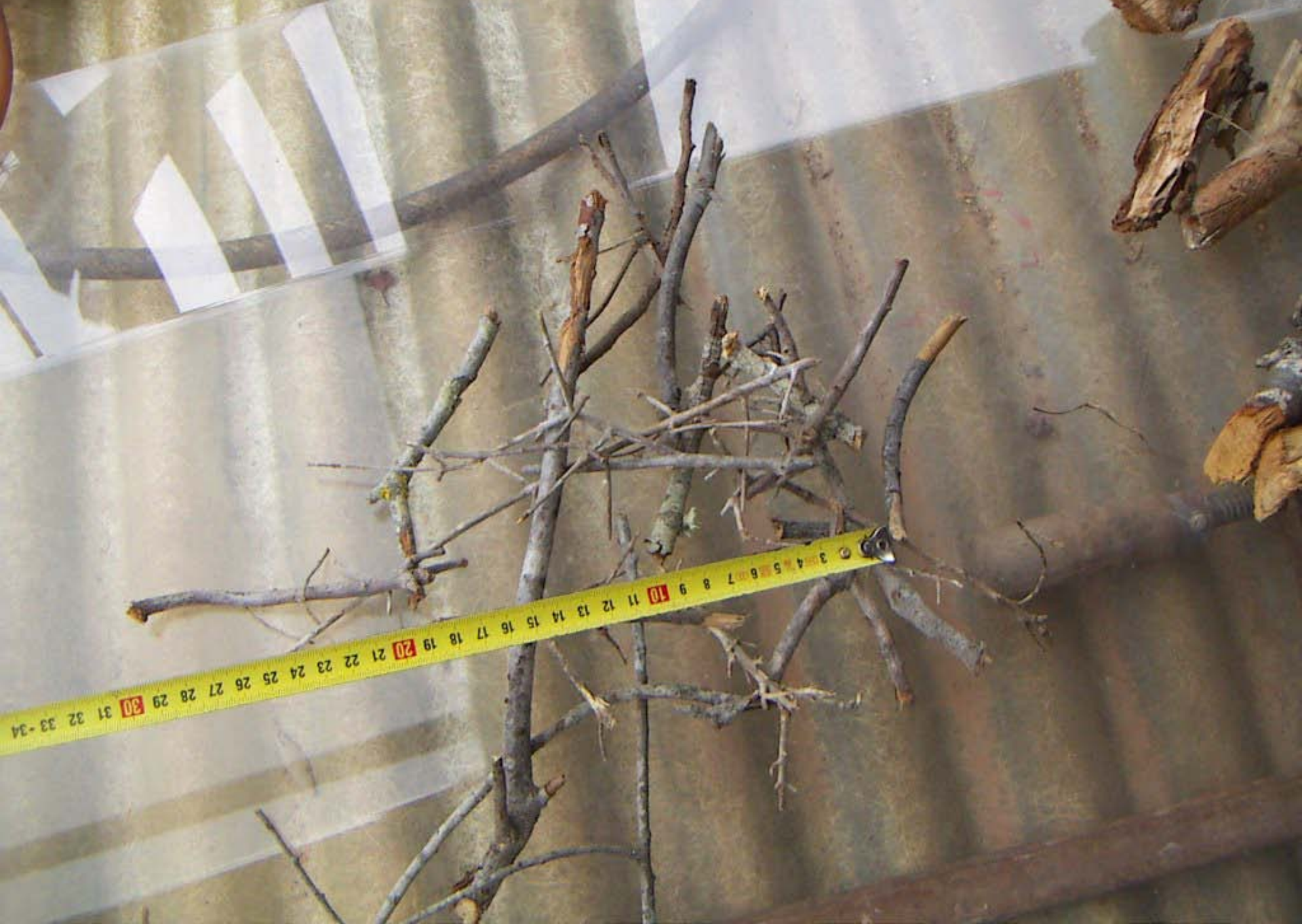
12 Fine twigs can be easily separated by winnowing