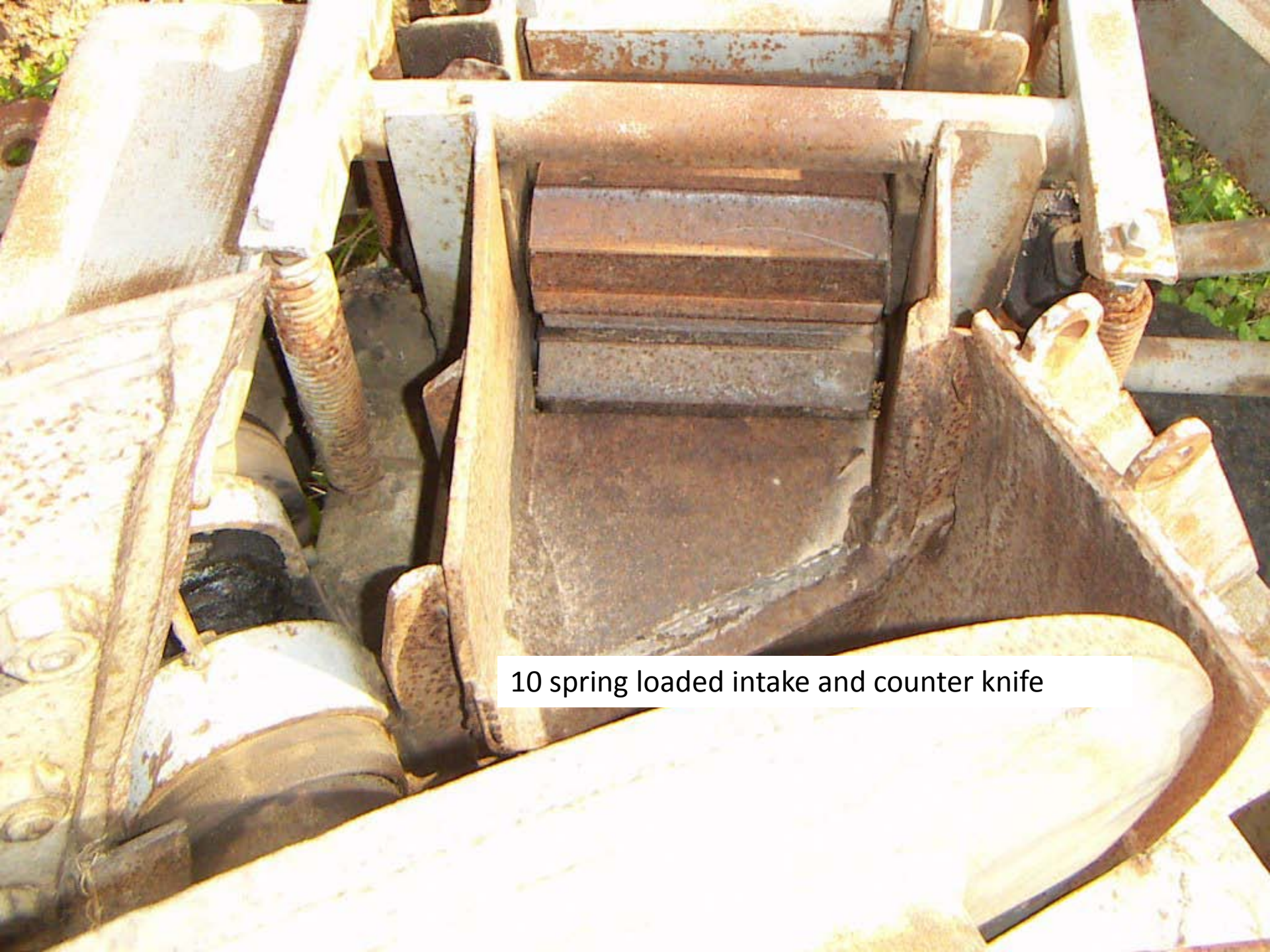
10 spring loaded intake and counter knife