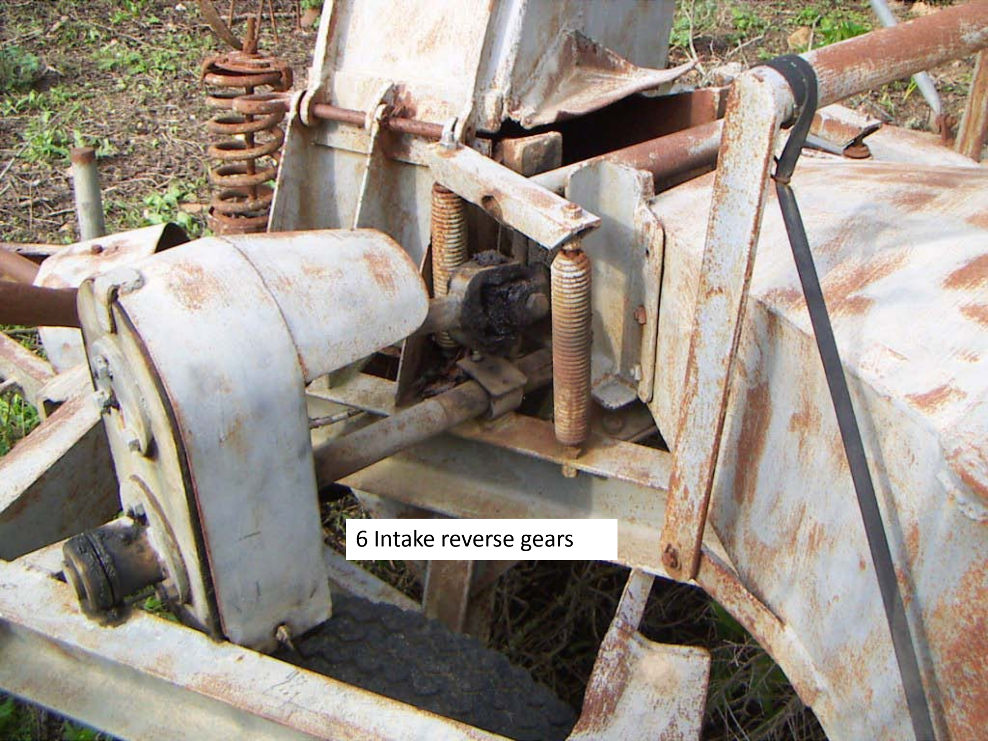
6 Intake reverse gears